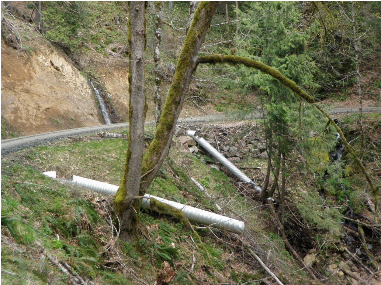
A hillside gravel road in Western Oregon forest with culverts.