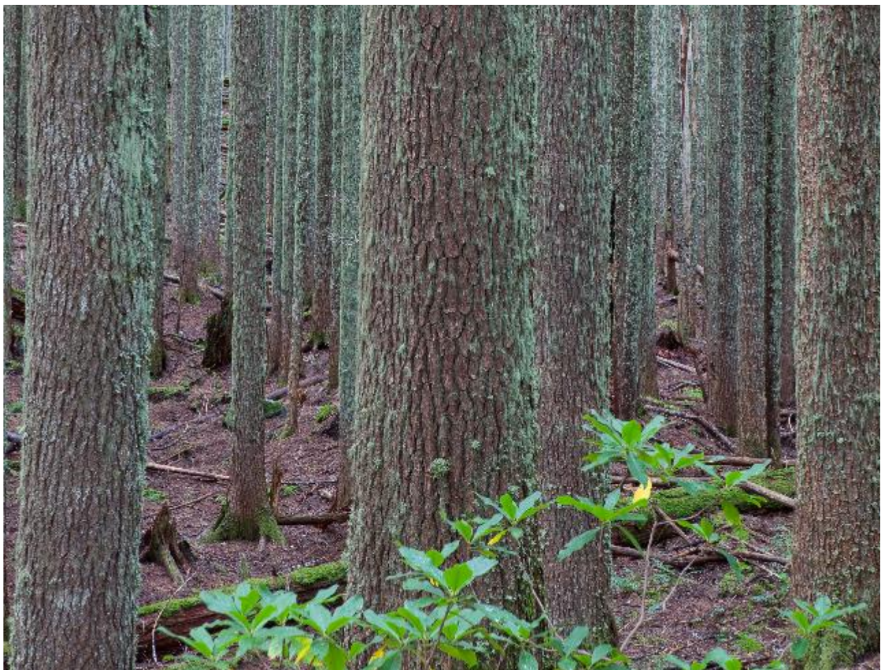
Table Rock Wilderness